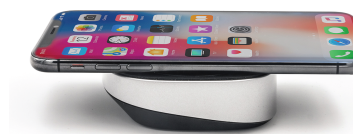
Phone not included