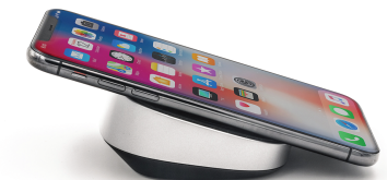
Rotate the base to inclined position for easy viewing